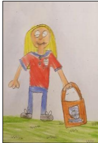
Illustration by Lyla