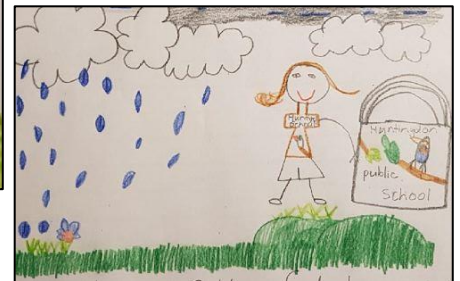
Illustration by Bella